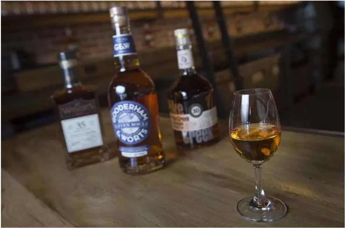
J.P. Wiser's 35 years, Gooderham and Worts Eleven Souls, and Pike Creek 10 year Rum Barrel Finish, (left to right) all of which recently won awards for whisky, are on display at Hiram Walker and Sons Distillery on Jan. 21, 2019.